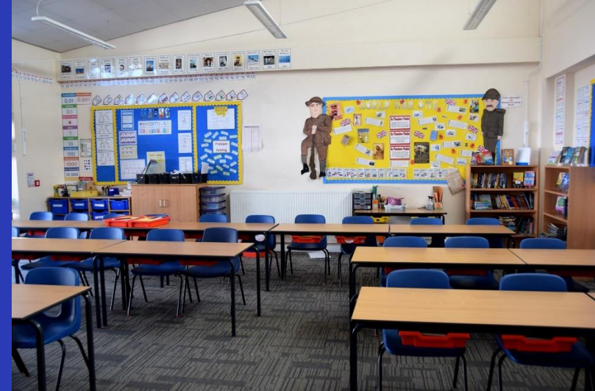
6RC Classroom (Table set up will be different)