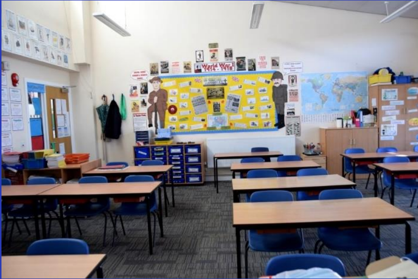
6MP Classroom (Table set up will be different)