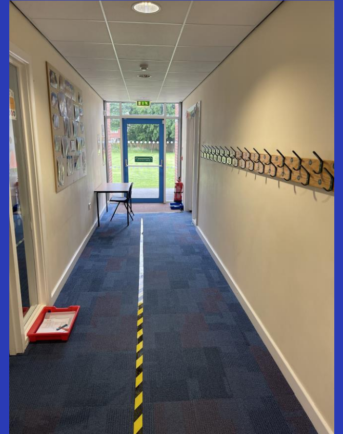
Our cloakroom area