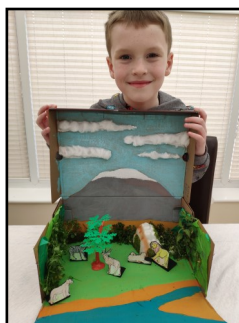
Jack's African habitat